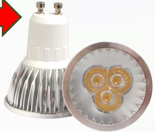
LED SPOTLIGHT 220-240V 3X1W GU10 base = 35W Halogen Lamps