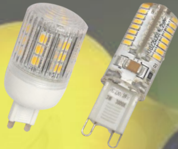
SMD G9/G4 BIPIN LAMPS 220-AC12V 2W/3W/5W