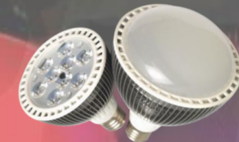
SMD PAR30/38 LAMPS 220-240V 10W/22W CREE