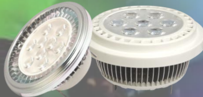
HIGH POWER ARX111 220- 240V 10W/22W CREE